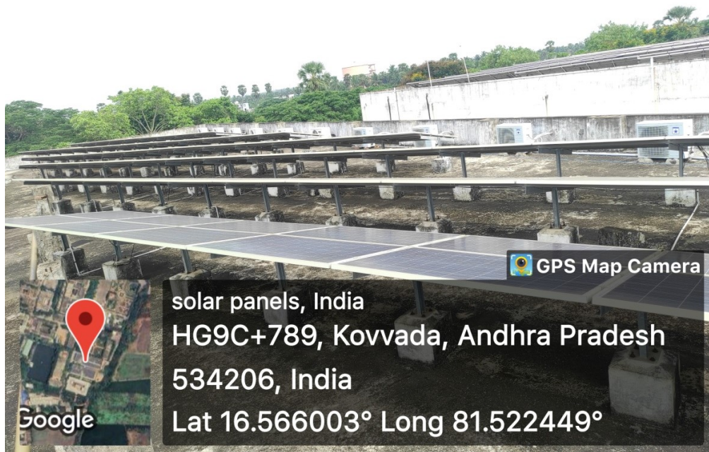
ROOF TOP SOLAR PLANT

Through the implementation of renewable energy in our Campus, we have successfully reduced approximately 220 tons of CO 2 emissions annually. Furthermore, in our pursuit of maximizing solar power utilization, our students and staff have designed a smart solar panel cleaning machine. This innovation has significantly increased power generation by a noteworthy percentage.