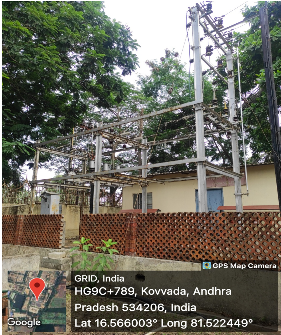
GRID CONNECTION OF ROOF TOP SOLAR POWER PLANT